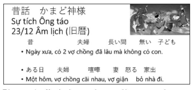
Figure 1. Mythology via reading exercises

For each lesson, the participants were introduced to new vocabulary and basic expressions related to a socio-cultural theme.