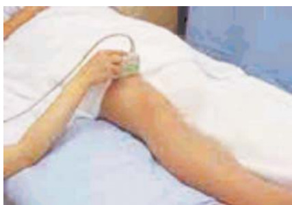
Figure 2 . Leg position

In previous basic methodologic studies on ultrasound measurement 10,19) , subjects stood upright so that measurements could be taken at various points on the body. However, many patients requiring nursing care cannot stand. Consequently, in this study, measurements were taken in the supine position with the legs extended (Figure 2).